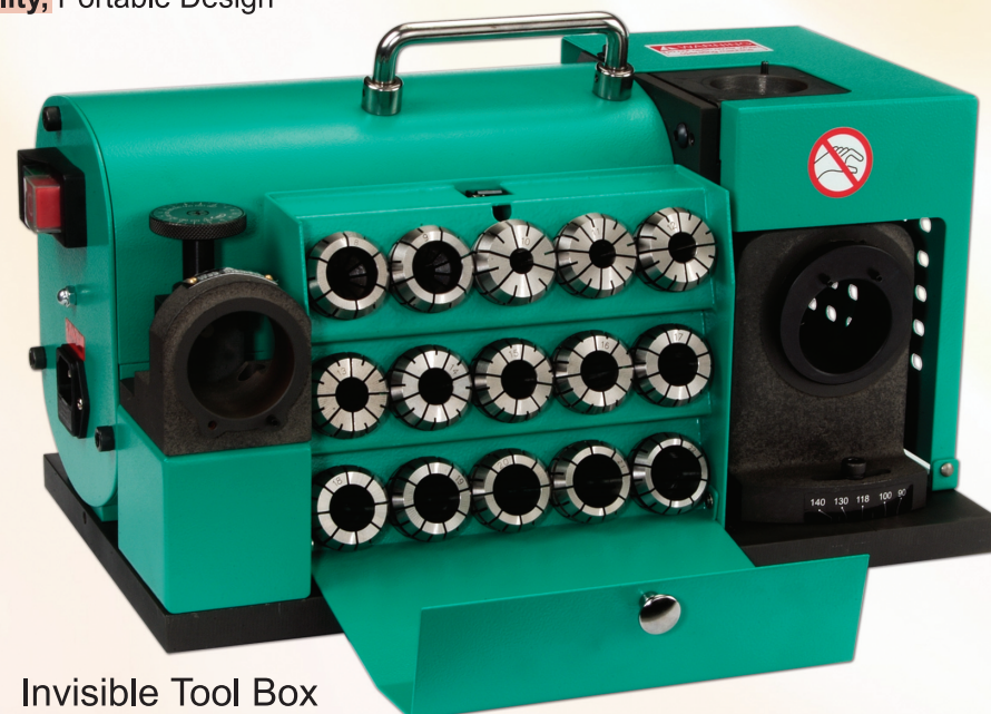
Invisible Tool Box